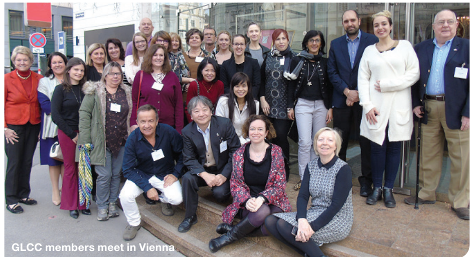
GLCC members meet in Vienna

To join us, please read our membership criteria, and download a membership application form at www.lungcancercoalition.org