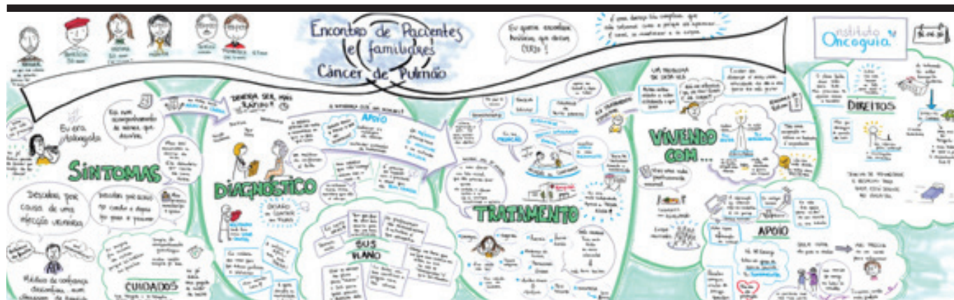
Instituto Oncoguia worked with Brazilian lung cancer patients to understand the issues they face.

Brazil have a better quality of life by taking action in the following four ways: