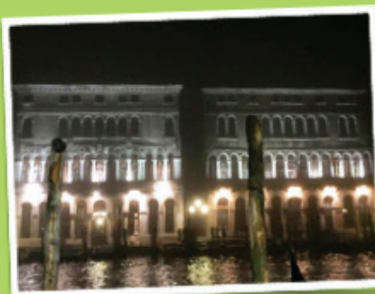
Ca' Loredan and Ca' Farsetti, Venice

ALCASE Italia said they were particularly pleased that towns and cities from both the north and south of Italy both took part in Illumina Novembre . The organisation believes increased participation maybe because the media is increasingly covering lung cancer issues, including recent breakthroughs in targeted agents and immunotherapy. In addition, the public are becoming more aware that lung cancer is not just an illness that affects old men and heavy smokers; it is a disease that can affect all adults, no matter their age, where they live or their social status.